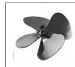
四叶搅拌桨 Four-blade paddle