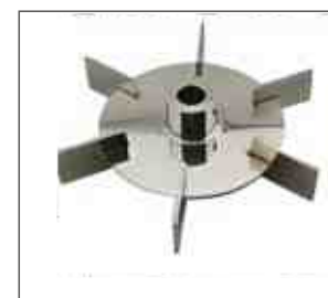
直叶涡轮式搅拌桨 Straight blade turbine agitator