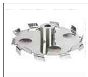
锯齿圆盘式 Sawtooth disc