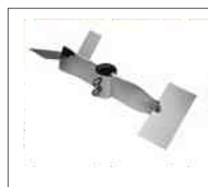
MIG搅拌桨 Mig paddle