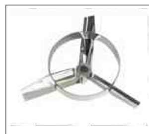
涡轮式搅拌桨 Turbine agitator