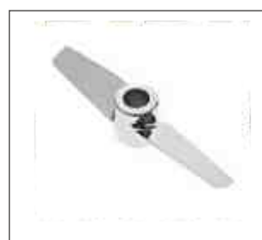
二叶桨叶 Two-leaf paddle