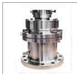
207集装箱式机械密封 207 containerized mechanical seal