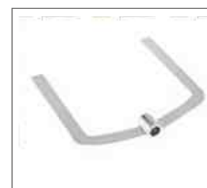
辅式 Auxiliary type