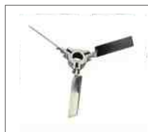
折叠离心式 Folding centrifugal type