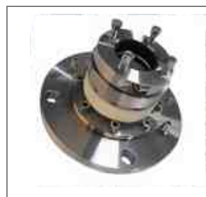
212侧入式系列机械密封 212 side entry series mechanical seals