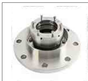
单端面机械密封 Single mechanical seal