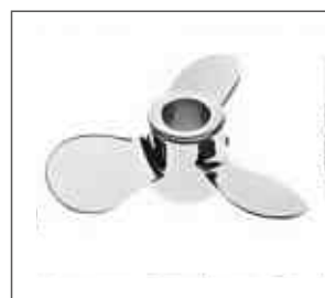
三叶推进式 Three-blade propulsion