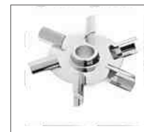
涡流式桨叶 Vortex paddle