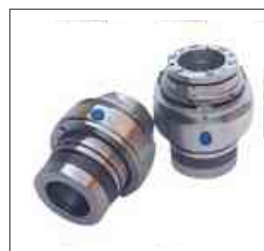
机械密封 Mechanical seal