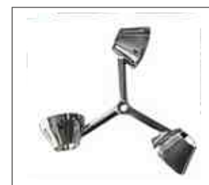
W杯型漏斗叶片 W cup funnel blade